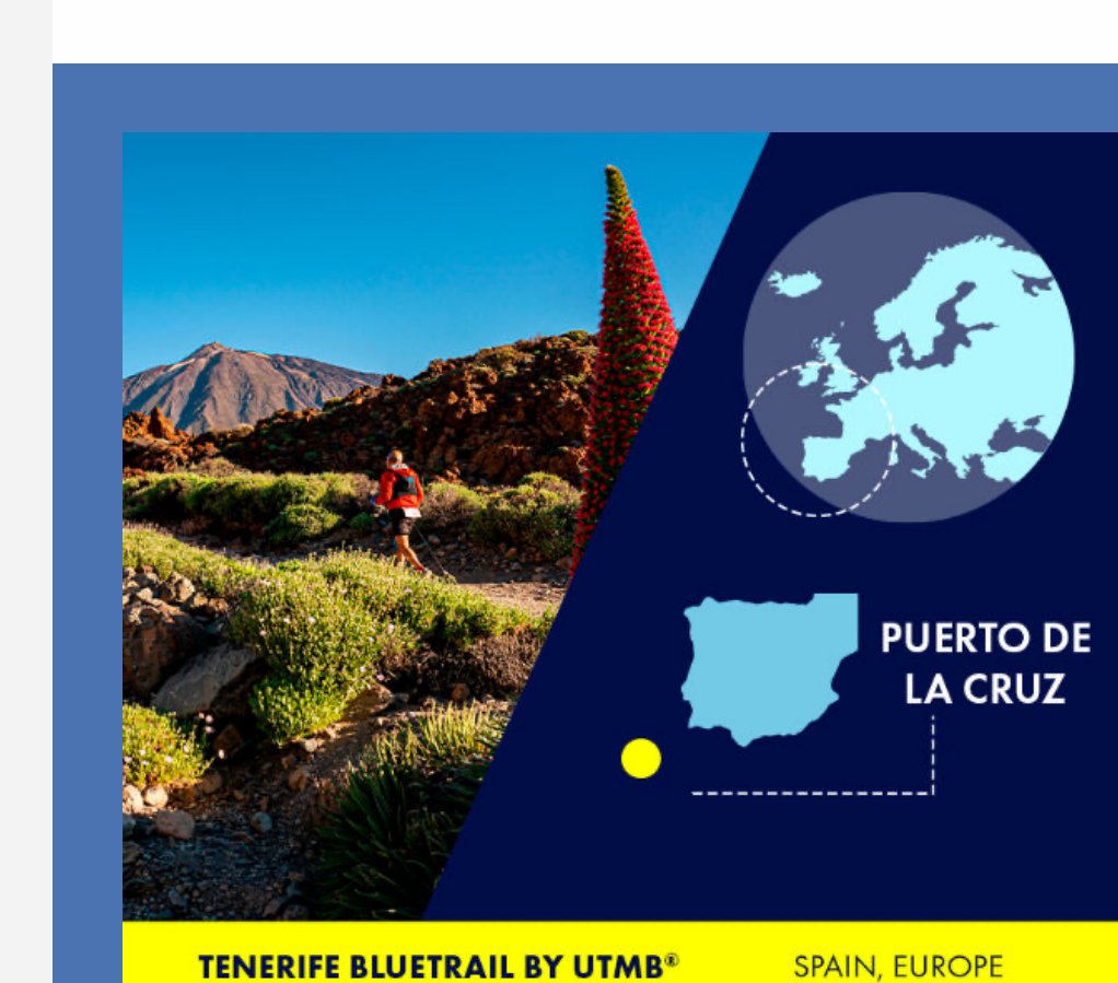
Tenerife Bluetrail by UTMB® makes its debut on the UTMB World Series stage on 6-8 June, as over 3,000 participants prepare to reach new heights at the highest race in Spain, on the largest of the Spanish Canary Islands.

UTMB World Series heads to highest race in Spain at Tenerife Bluetrail by UTMB®